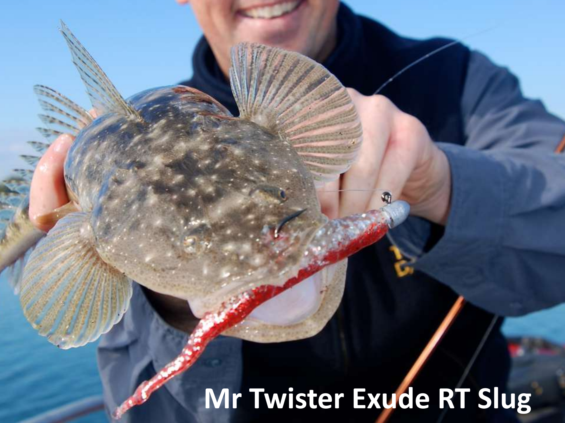
Mr Twister Exude RT Slug